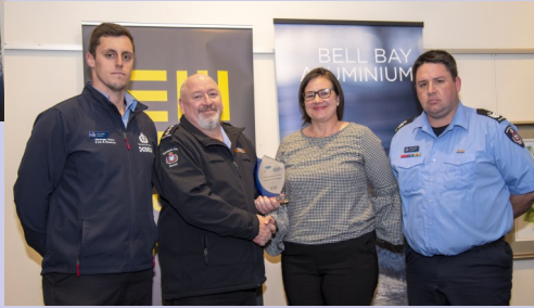
Healthy workplace of the year Award, George Town Fire Brigade.