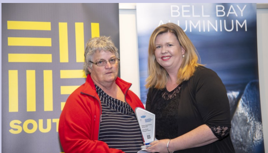
Visitor Experience of the Year Award, Low Head Penguin Tours.

Thank you to all that participated in the Awards this year.