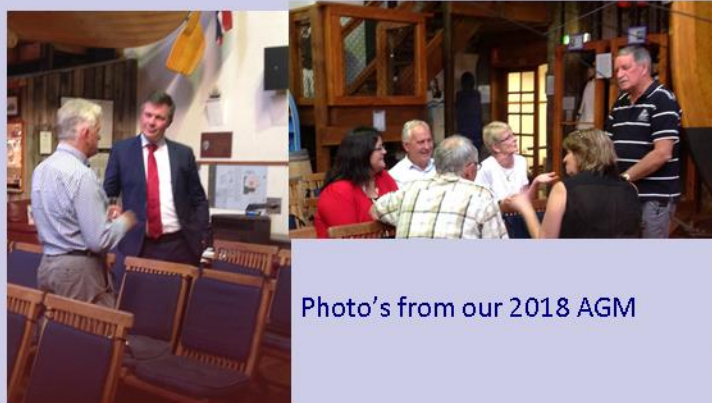
Photo's from our 2018 AGM

All financial members are encouraged to attend and to take the opportunity to network with other businesses and representatives from State and Local government.